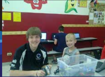
2018 World Champion Finalists